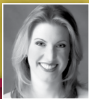
AMANDA MAJESKI as Blanche

At the Benedum Center for the Performing Arts Sung in French with English texts projected above the stage